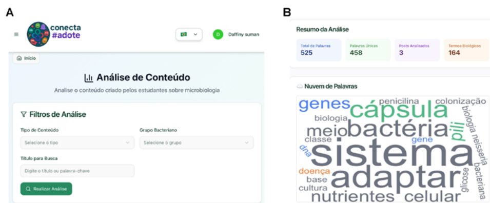
Figure 5 Interface of the analysis area of the Conecta#Adote platform.

Note. Prepared by the authors (2026). [A] Content Analysis Module, in which the user selects the type of post, the adopted bacterial group, and the desired title to start automatic processing. [B] Example of analysis applied to posts from the "Adote uma Bactéria" activity on the platform. Three publications from the Neisseria group were evaluated, resulting in a total of 525 words, of which 458 were unique and 164 were identified biological terms. The word cloud highlights the most recurrent concepts present in the posts.