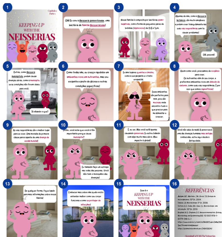
Figure 2 Examples of posts from the 2024 “Adote uma Bactéria” activity, Neisseria group.

Posts were manually collected from the activity’s official Instagram® profile (Figure 2) using institutional access. Each publication was saved individually as an image and subsequently transferred to the platform environment, simulating the original posting process. This approach aimed to faithfully reproduce the system’s usage dynamics, ensuring real-world conditions for interaction and analysis. The resulting dataset served as a basis for testing functionalities related to organization, storage, and automated academic data analysis, thereby validating the platform’s performance and applicability in an educational context.